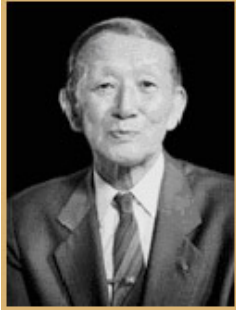
Dr. Shinichi Suzuki